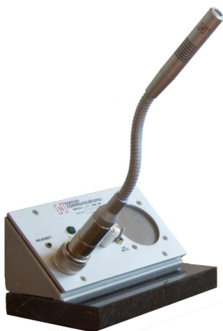
Inside Unit (Attendants Side)

Please specify barrier thickness when ordering. The prism unit is quickly and easily mounted on the counter-top on the inside of the barrier, at a convenient location for the user. A power adapter and all cables are supplied. The TTU-7X comes with a continuous-duty, 90-240 VAC 1 Amp power supply which is stepped down to 15 Volts.